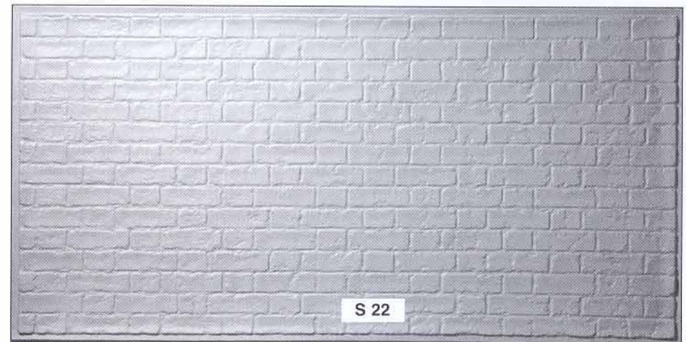
Flemish brickwork Brick size: 190 x 58 mm Panel size: 2116 x 1030 x 8 mm

Standard designs made in vac formed plastic 0.5mm P.V.C., 1.2mm A.B.S. or G.R.P. ( glassfibre ) High Strength Plaster backed with hessian scrim for use in pubs and themed areas also available