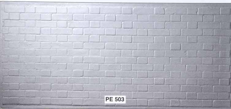
Flemish flettons Brick size: 215 x 66 mm Panel size: 2400 x 1060 x 8 mm