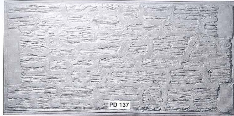
Over pointed and eroded blocks Panel size: 2315 x 1110 x 20 mm