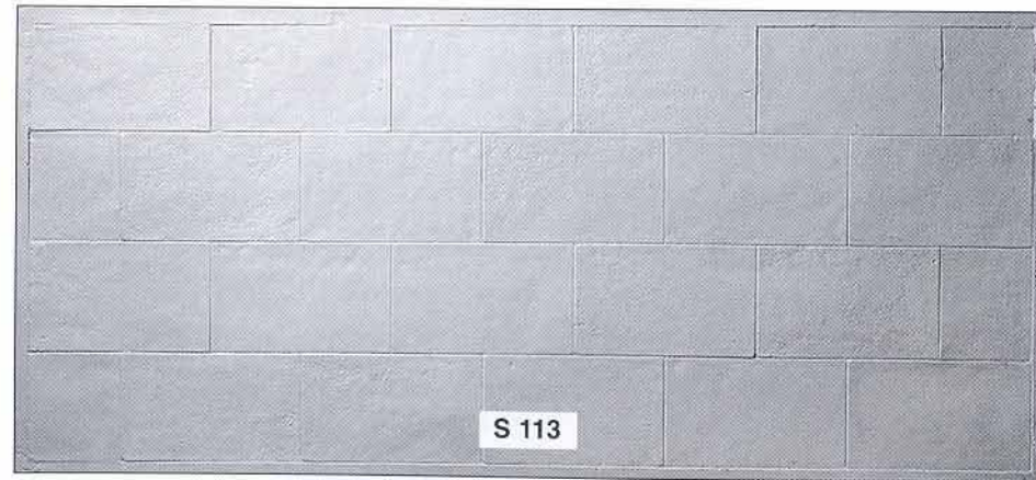
Light texture stone blocks: 380 x 230mm Panel size: 2100 x 920 x 10 mm

Standard designs made in vac formed plastic 0.5mm P.V.C., 1.2mm A.B.S. or G.R.P. ( glassfibre ) High Strength Plaster backed with hessian scrim for use in pubs and themed areas also available