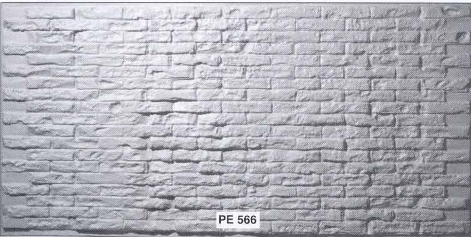
Stretcher bond - eroded brickwork Brick size: 245 x 55 mm Panel size: 2370 x 1130 x 30 mm Corner section available: PE 567 - 1780 x 360 x 360 mm