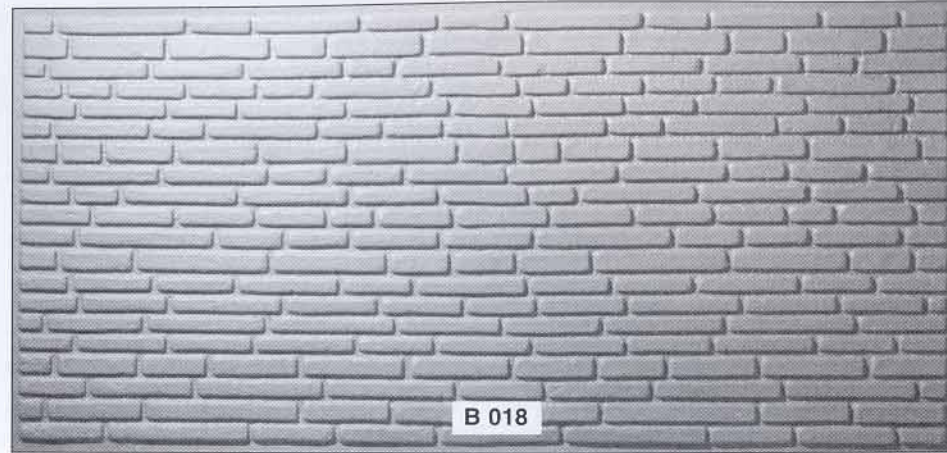
Smooth Roman brickwork Panel size: 2290 x 1070 x 15 mm